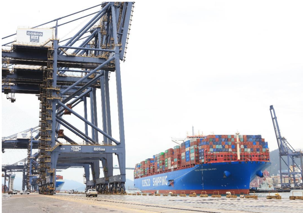
COSCO SHIPPING GALAXY berthing at Hong Kong's Terminal 8