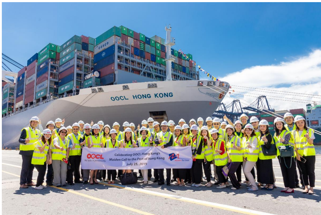
Guests welcome the arrival of OOCL HONG KONG on her maiden call to Hong Kong