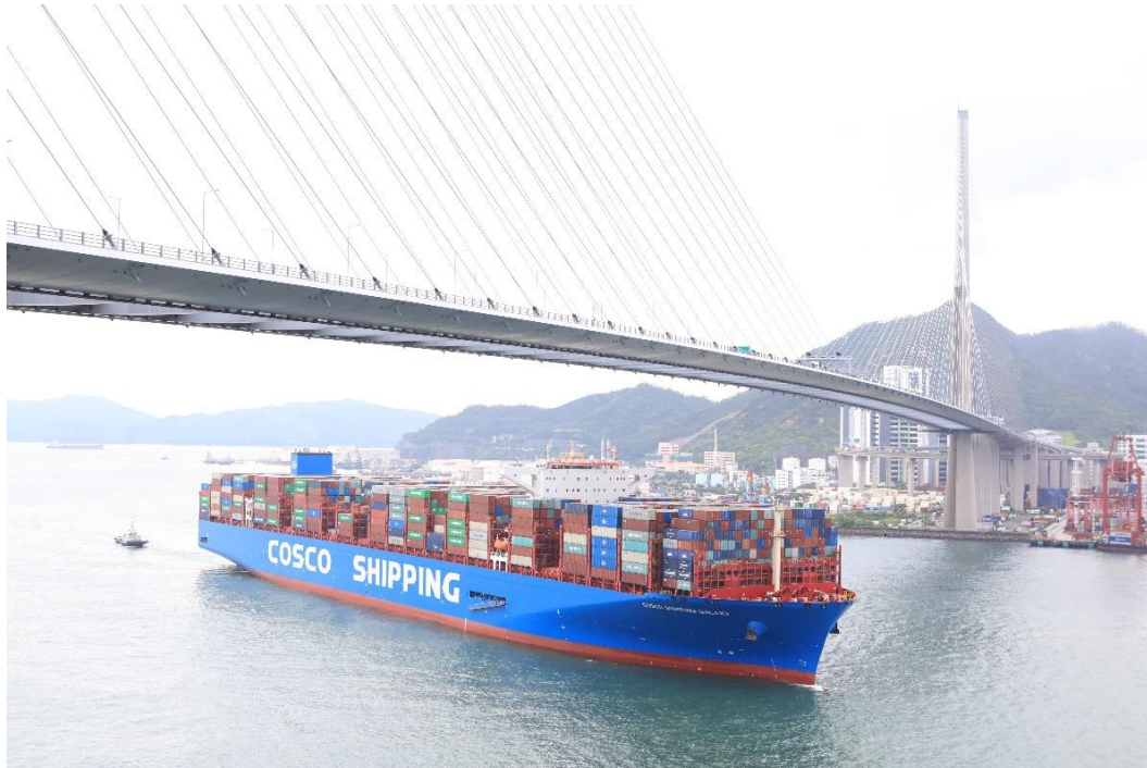
COSCO SHIPPING GALAXY passing through the Stonecutters Bridge and entering into Hong Kong Kwai Tsing Container Port