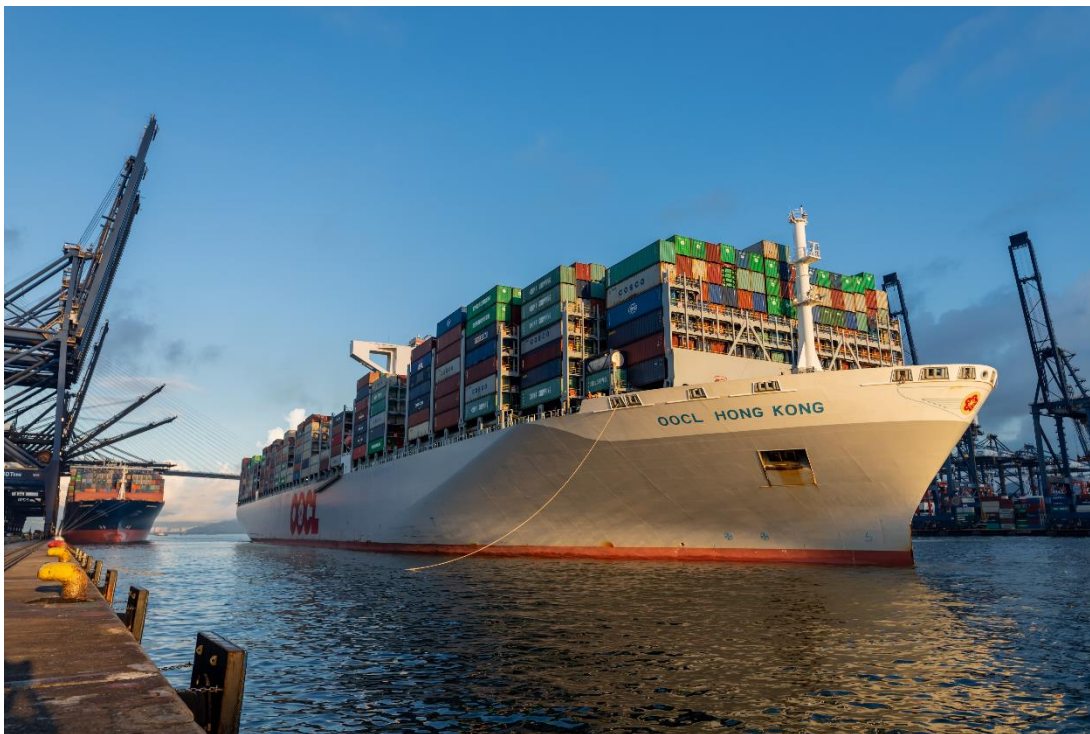
OOCL HONG KONG berths at HKSPA's facilities at Terminal 8